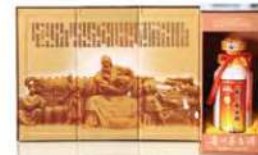
豪華金 Luxury Gold

Selected and Blended by Maestros, Two Tastes in One Liquor for You to Enjoy the Exquisite Life