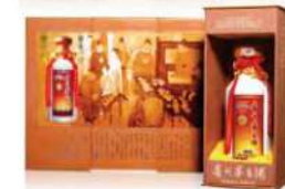
豪華絳 Luxury Brown